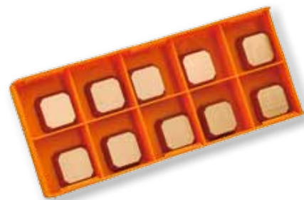
Art. Nr. 25909