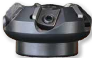
Art. Nr. 28221