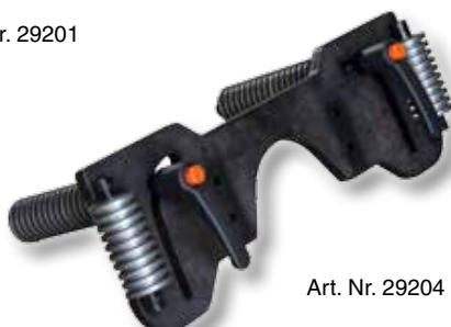
Art. Nr. 29204