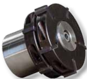
Art. Nr. 29201