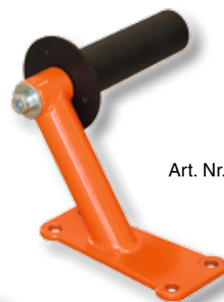
Art. Nr. 29206