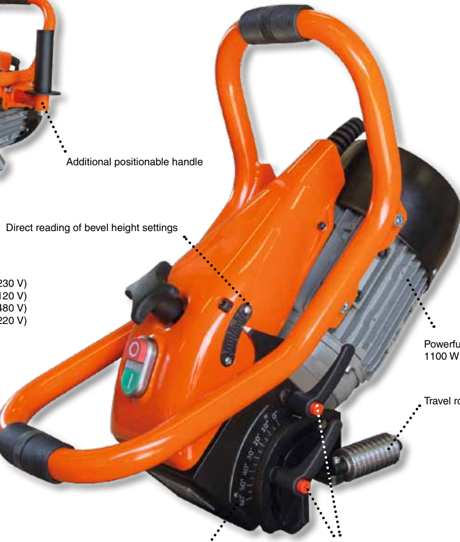
Direct reading of bevel height settings