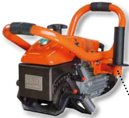
Additional positionable handle