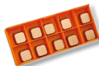
Art. Nr. 29203