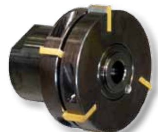
Art. Nr. 29202