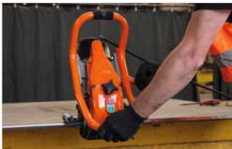
Fast lockable machine setting