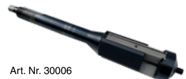
Art. Nr. 30006