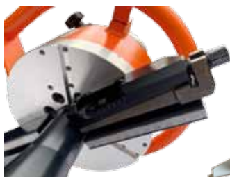
Art. Nr. 30007