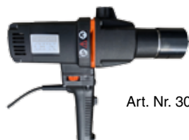
Art. Nr. 30008