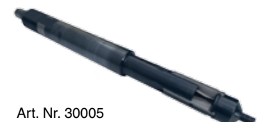
Art. Nr. 30005